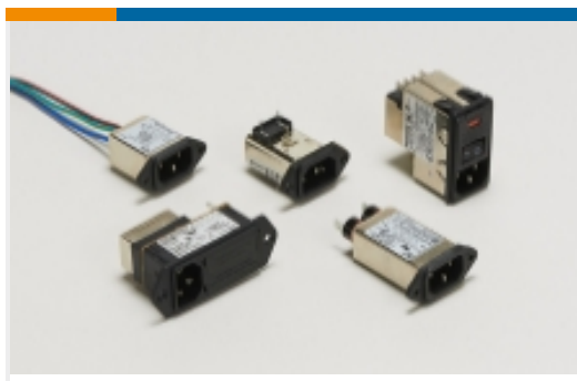
Multi-Function Inlet Filters(22)