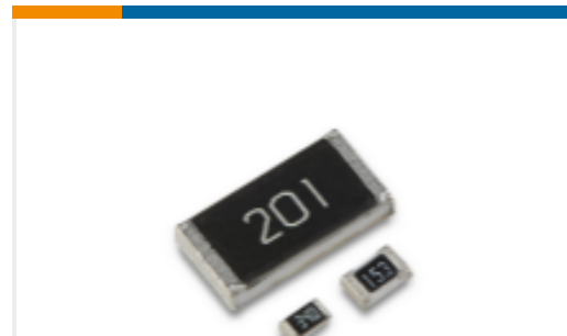
TE Part #2176326-9 CRGP 0603 47R 1%