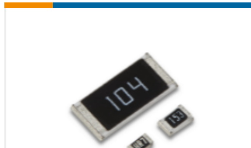
TE Part #2-2176337-2 CRGCO 0402 560R 1%