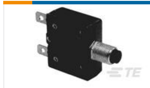
TE Part #1423674-8 W54-XB1A4A10-15=CKTBKR,THERM,P