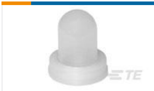
TE Part #1-1423696-6 BOOTSEAL,M11,CLEAR,SILICONE