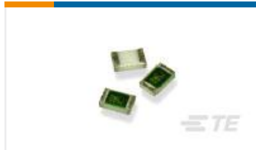
TE Part #1-1879417-9 CPF 0603 1M0 0.1% 25PPM 1K RL