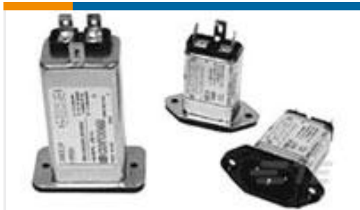
TE Part #6609006-1 1EEJ1=F8005 S0