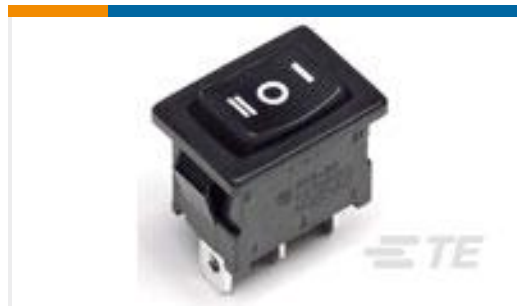
TE Part #1571076-9 PRASA1-16F-BB000=POWER ROCKER