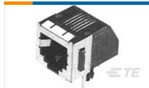
TE Part #5555154-1 MJ,R/A,LPF,6P/6C,SHLD,PNL,TRAY