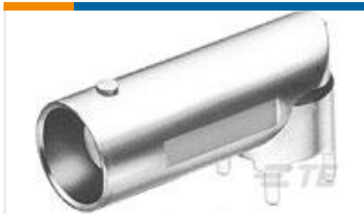
TE Part #5413631-1 JACK,RTANG, PCB,50 OHM, BNC