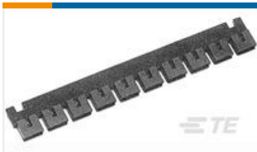
TE Part #382575-2 2MM MINI-SHUNT ASSEMBLY 15 AU