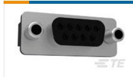
TE Part #5750678-1 09 RCPT SP/FMS (RET SL)