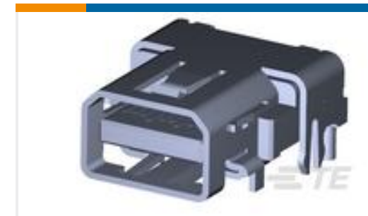
TE Part #2129320-3 Mini Displayport Reverse Offset