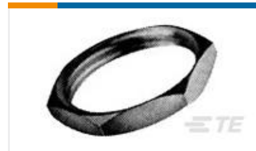
TE Part #1-329631-2 JAM NUT, PLATED