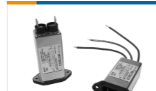
TE Part #4-1609157-1 IEC Filtered Inlets, Corcom EJT Series