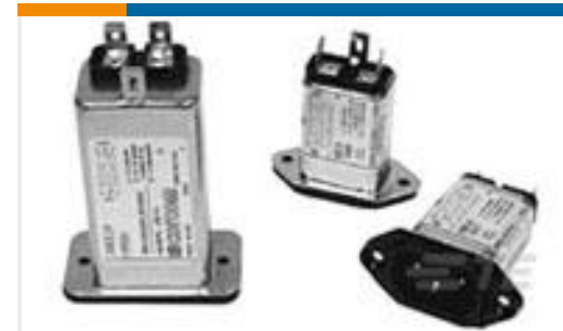
TE Part #6609006-1 1EEJ1=F8005 S0