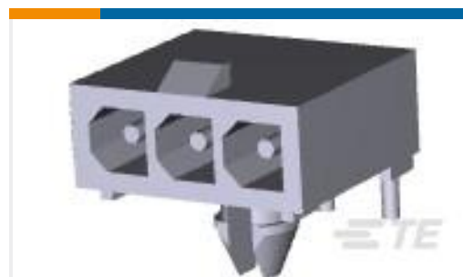
TE Part #1-770967-0 03P MINI UMNL R/A HDR ASSY SN