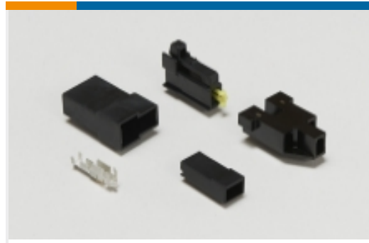
Magnet Wire Terminals(196)