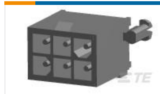
TE Part #1-770178-0 06P MINI-UMNL ASSY VO SNNI*