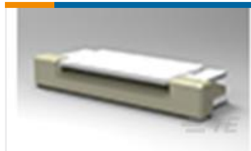
TE Part #4-1734839-0 FPC CONN. 0.5MM PITCH T/C,40P