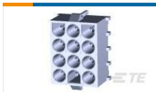
TE Part #641974-1 12P UMNL PIN HDR ASSY 94VO