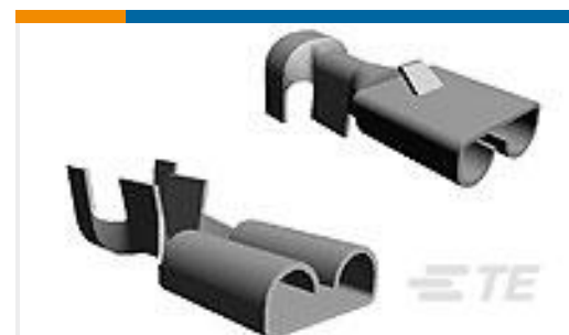
TE Part #42100-1 FF 250 REC 18-14AWG BR