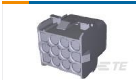
TE Part #350783-1 12P UMNL CAP HSG