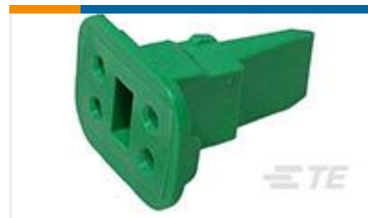
TE Part #W4S-P012 WEDGE LOCK, 4P, PLG, GRN, SL RET, DT