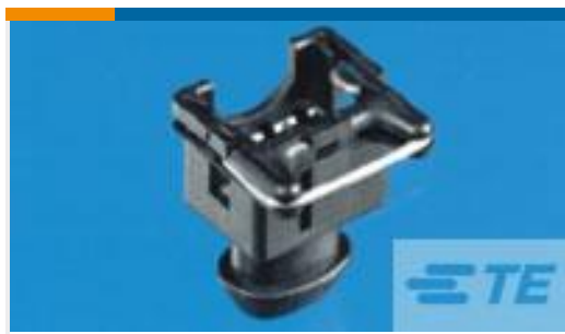
TE Part #827551-3 JUNIOR TIMER CONNECTOR-HSG