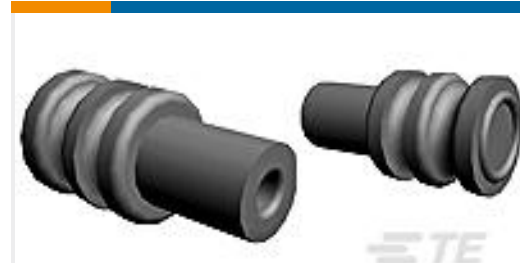
TE Part #963530-1 EINZELLEITERDICHTNG