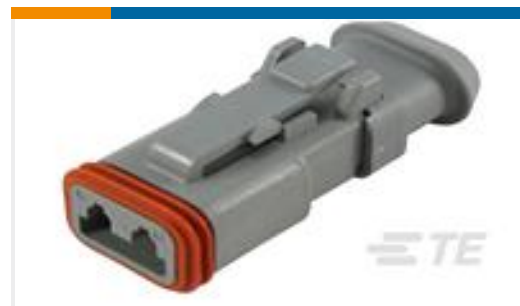
TE Part #DT06-2S-E008 PLG, 2P, GRY, N, XCAP