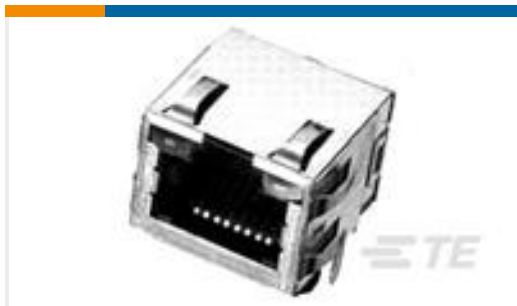
TE Part #2-406549-8 IMJ,1X1,PNL GRD,LED(YG/YG), SN