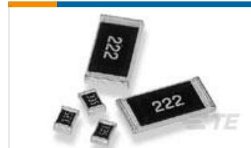
TE Part #1623174-1 CRG0805 1% 2K2