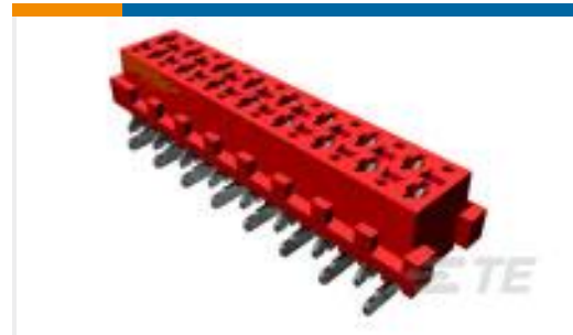
TE Part #9-188275-0 MICRO-MATCH SMD FTE