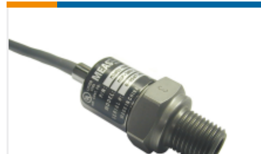
TE Part #M3031-000005-100PG PRESS XDCR M3031-000005-100PG