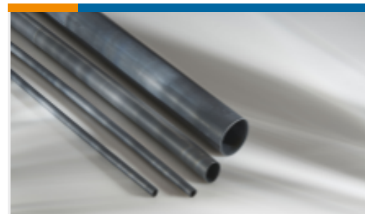
TE Part #EH2293-000 DWFR Heat shrink Tubing