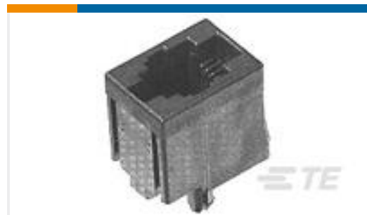
TE Part #5520259-4 MJ, TE, 8P, TRAYS