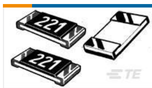
TE Part #5-2176230-5 3522 27K 5% 3W