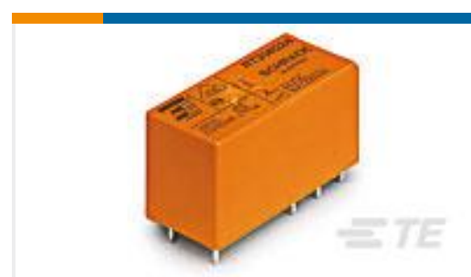
TE Part #8-1393239-7 RT314F12