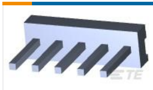
TE Part #640383-5 05P MTA156 HDR ASSY STR SQ SN