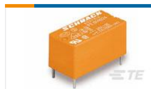
TE Part #1-1393219-0 PE014024