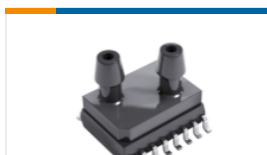
TE Part #9541-040C-D-C-3-S PRESSURE I2C 0.6 PSID SO16