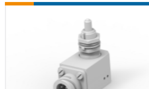
TE Part #K2018276 Limit switch G13-01-1120