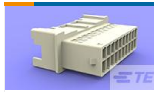
TE Part #1969592-8 HSG,REC,FREE-HANGING,DUALROW, EP2.5