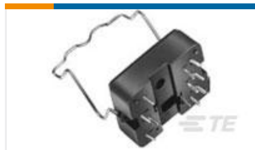
TE Part #9-1393809-1 V23154Z1002