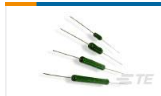
TE Part #1-1623774-3 C14 100K 5% (LOOSE)