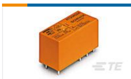
TE Part #1649328-4 RTD14012