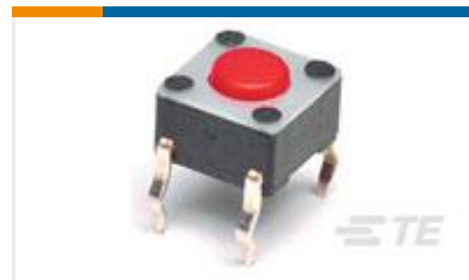
TE Part #2-1825910-7 FSM14JH=6MM TACT SWITCH, HIGH TEMP