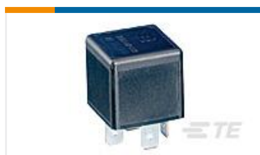
TE Part #1-1414167-0 V23134A0056X432-EV-CBOX