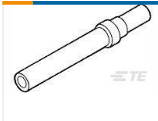
TE Part #206795-3 AMPLIMITE,SKT CONT ASY,SZ 20