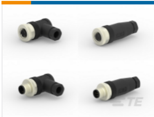
TE Part #T4111002051-000 M12 Field Installable Unshielded