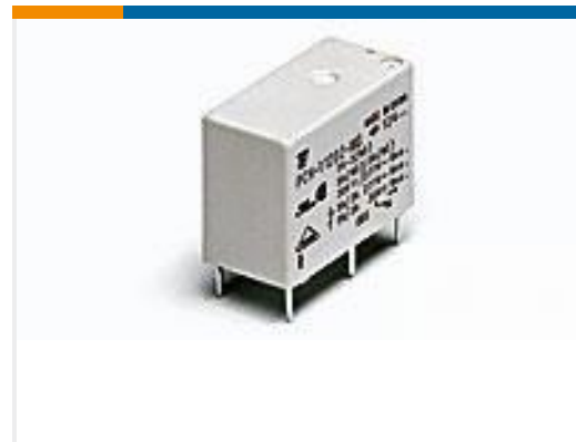
TE Part #1461410-4 PCH-148D2H,000