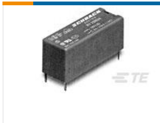
TE Part #2-1393225-9 RY612024