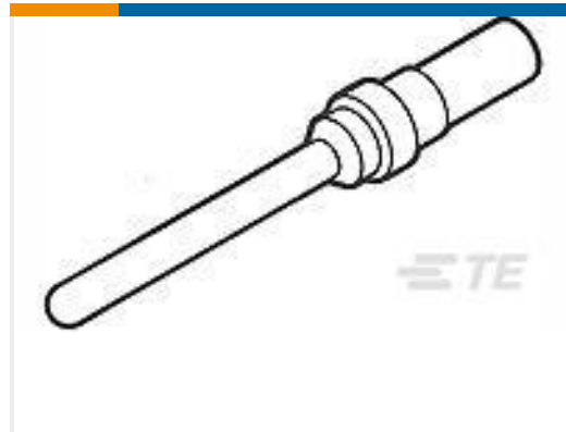
TE Part #206794-4 PIN CONTACT, SZ 20