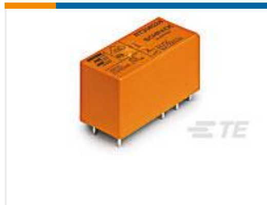
TE Part #1649328-4 RTD14012