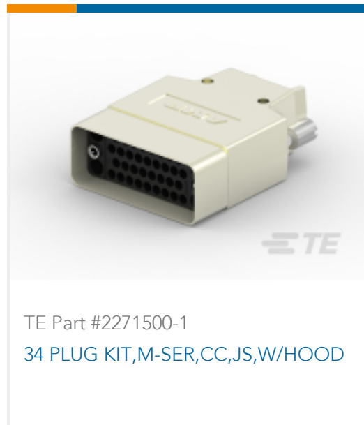
TE Part #2271500-1 34 PLUG KIT,M-SER,CC,JS,W/HOOD