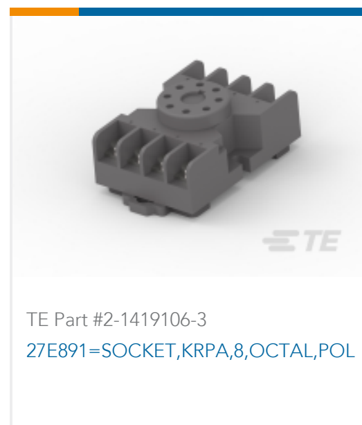
TE Part #2-1419106-3 27E891=SOCKET,KRPA,8,OCTAL,POL