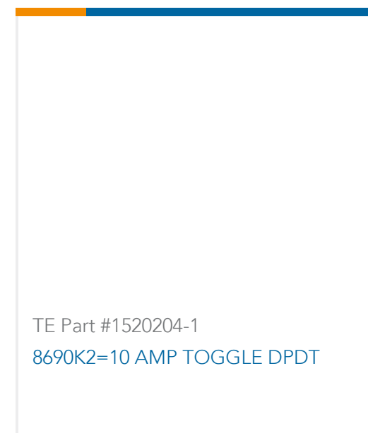
TE Part #1520204-1 8690K2=10 AMP TOGGLE DPDT