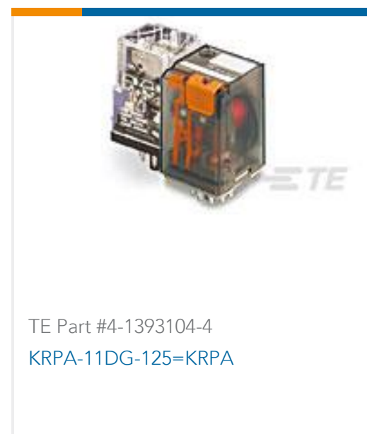
TE Part #4-1393104-4 KRPA-11DG-125=KRPA