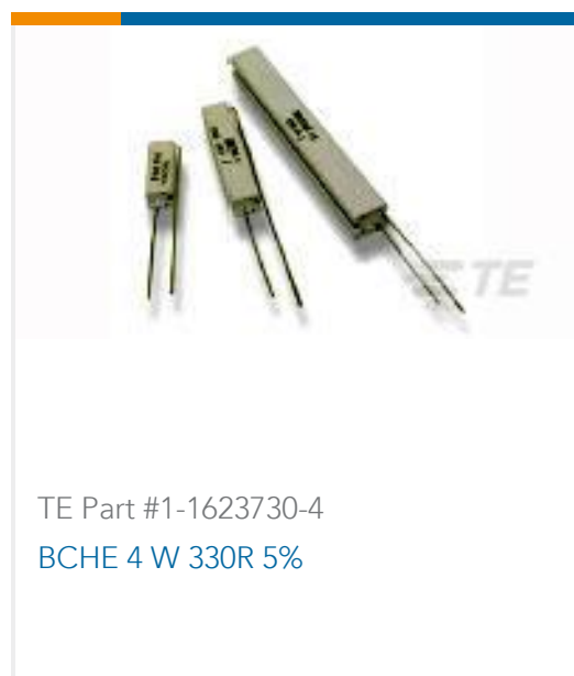
TE Part #1-1623730-4 BCHE 4 W 330R 5%