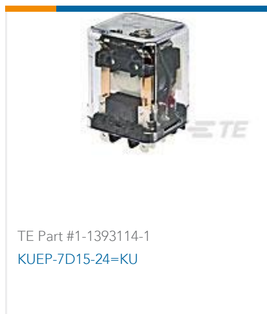
TE Part #1-1393114-1 KUEP-7D15-24=KU