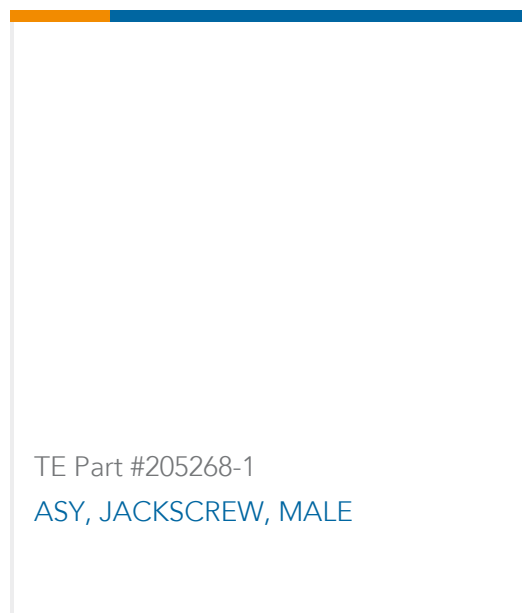
TE Part #205268-1 ASY, JACKSCREW, MALE