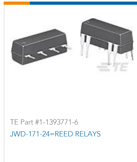
TE Part #1-1393771-6 JWD-171-24=REED RELAYS