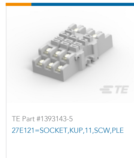
TE Part #1393143-5 27E121=SOCKET,KUP,11,SCW,PLE