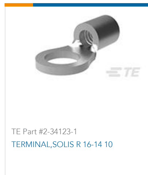
TE Part #2-34123-1 TERMINAL,SOLIS R 16-14 10