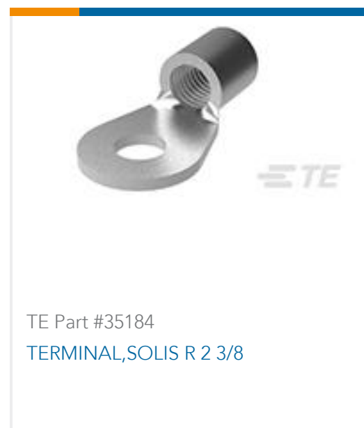
TE Part #35184 TERMINAL,SOLIS R 2 3/8