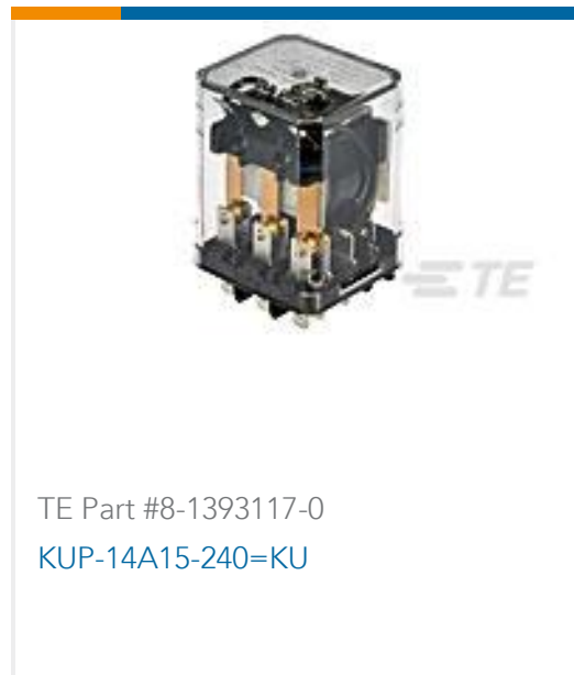
TE Part #8-1393117-0 KUP-14A15-240=KU