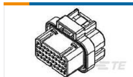
TE Part #3-1437290-7 26POS,SUPERSEAL,REC HSG ASSY, SLD,COD 1