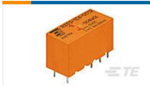
TE Part #5-1415899-5 RZ03-1C3-D024