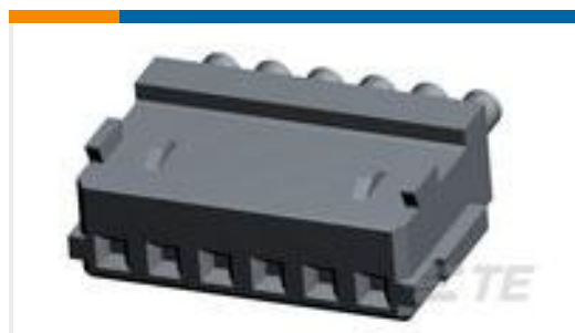
TE Part #2058943-5 Cable Assembly Mini CT 6 pos.