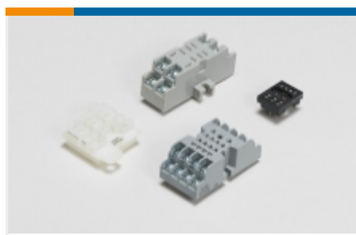
Relay Accessories, Sockets & Clips(5)