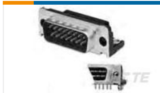
TE Part #747250-4 09 MSFL PLUG RA 318 (IN,FM)