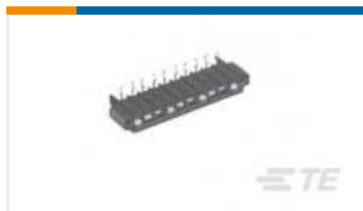
TE Part #5-520314-4 TRIOMATE ASSY H 4P L=2.54 LDFR