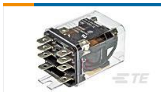
TE Part #8-1393114-4 KUHP-5A51-120=KU-