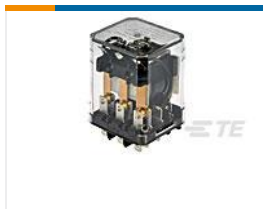
TE Part #2-1393117-2 KUP-11A15-240=KU