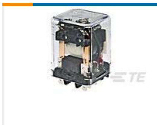
TE Part #8-1393113-8 KUEP-11D15-48=KU