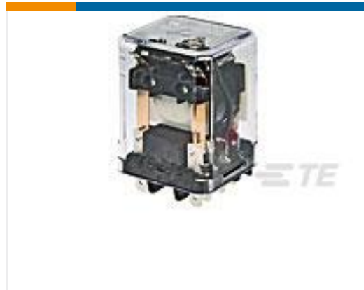
TE Part #1393114-1 KUEP-3D15-24=KU-