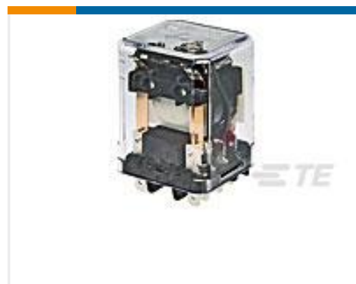
TE Part #1-1393114-2 KUEP-7D15-48=KU