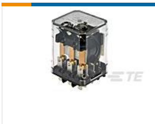
TE Part #4-1393117-5 KUP-11D15-24=KU