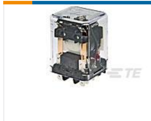
TE Part #1393114-2 KUEP-3D15-48=KU