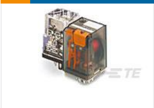
TE Part #4-1393104-6 KRPA-11DG-48=KRPA