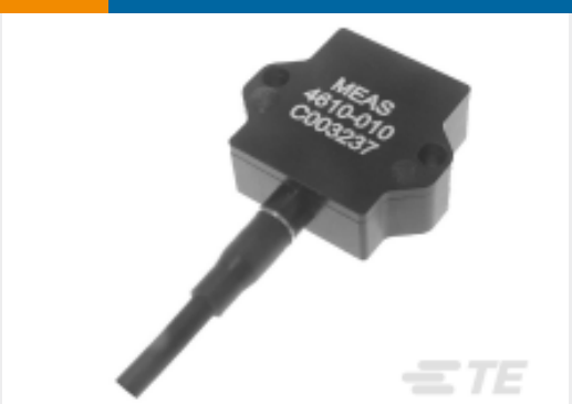
TE Part #20007015-00 4610-010-120-D