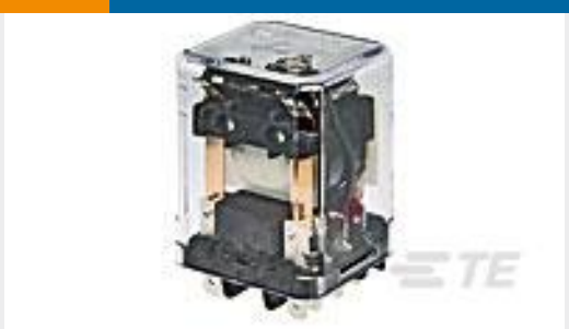
TE Part #8-1393113-7 KUEP-11D15-24=KU-