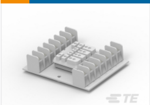
TE Part #2-1419106-2 27E867=SOCKET,KU,,ASSY,4 POLE,