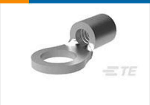
TE Part #320093 TERMINAL,SOLIS R 16-14 10