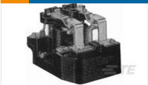
TE Part #5-1393127-5 PRD-11DJ0-24=PRD