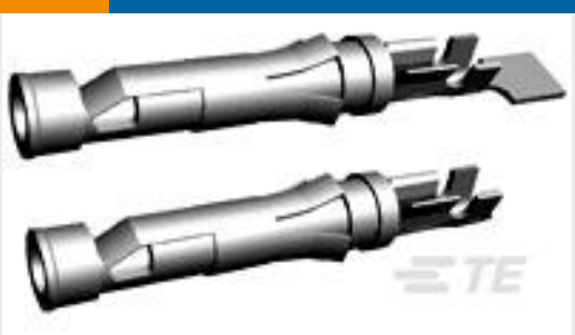
TE Part #66601-1 III+ SKT,18-14,TIN-LEAD,LP