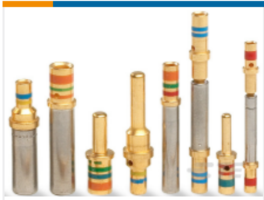
TE Part #0007-008-100L CONT SOC ASSY