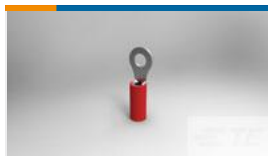
TE Part #36152 PIDG R 22-16 COMM 22-18 MIL 6