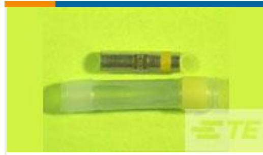
TE Part #650075N003 D-436-37CS454