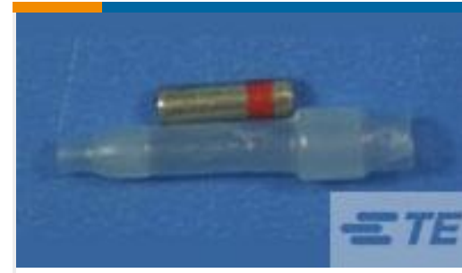
TE Part #650074N006 D-436-36CS454