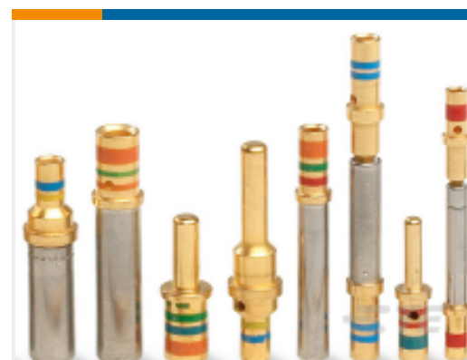
TE Part #0004-058-100L CONT PIN