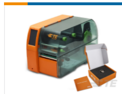
TE Part #1-2186501-1 T3212-SWARE-PRINTER