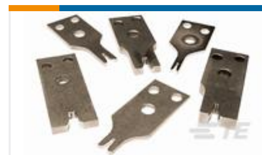
TE Part #5-1633730-0 CRIMPER, WIRE F.120F