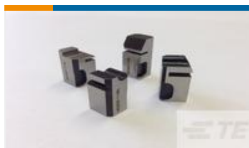
TE Part #314891-1 FLOATING SHEAR