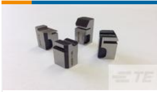
TE Part #454276-1 FLOATING SHEAR