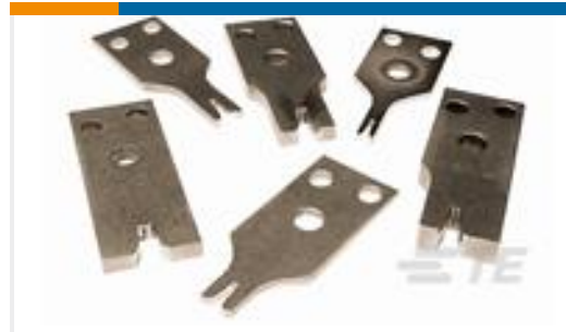
TE Part #453910-1 CRIMPER, WIRE-.180 WIDE F