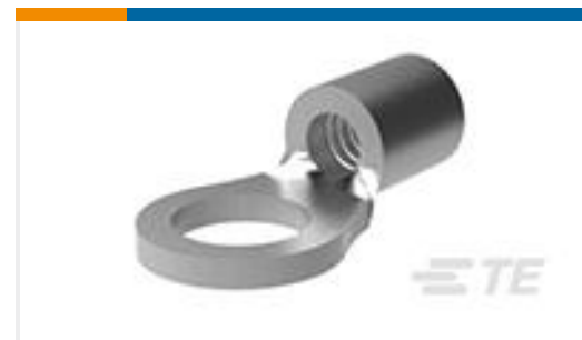
TE Part #35668 TERMINAL,SOLIS R 4 1/2