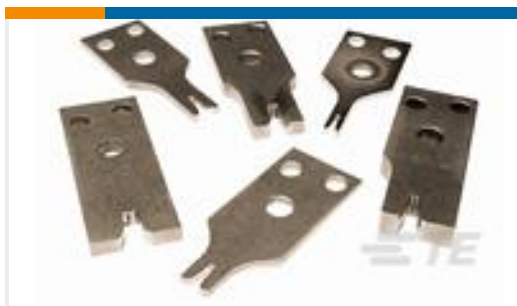
TE Part #2-456404-5 CRIMPER, WIRE .070