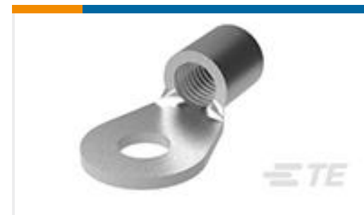
TE Part #321871 BODY SOLIS RING 2/0 3/8