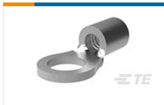
TE Part #35664 TERMINAL,SOLIS R 8 1/2