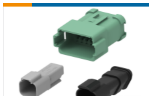
TE Part #DT04-3P-E003 DEUTSCH DT Receptacle Connectors