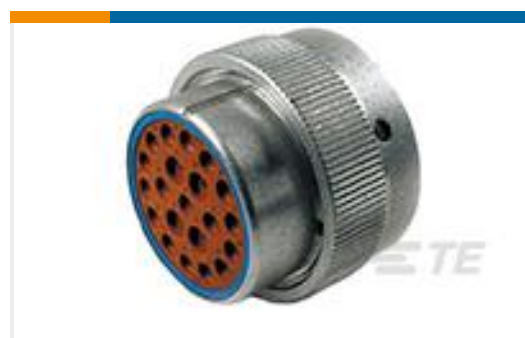
TE Part #HD36-24-21SE PLG, 21P, AL, E, 12/16, S