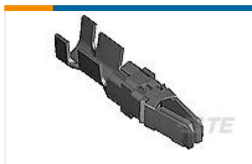
TE Part #66741-2 TYPE XII FEMALE CONT (L.P.)