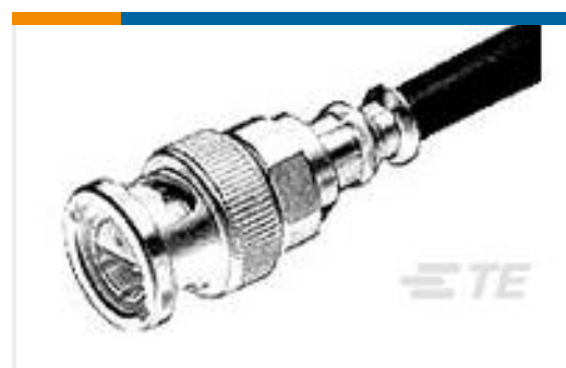
TE Part #5332225-5 PLUG, TWIN BNC,