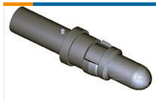
TE Part #212007-1 CONTACT PIN ASSY, SZ 8