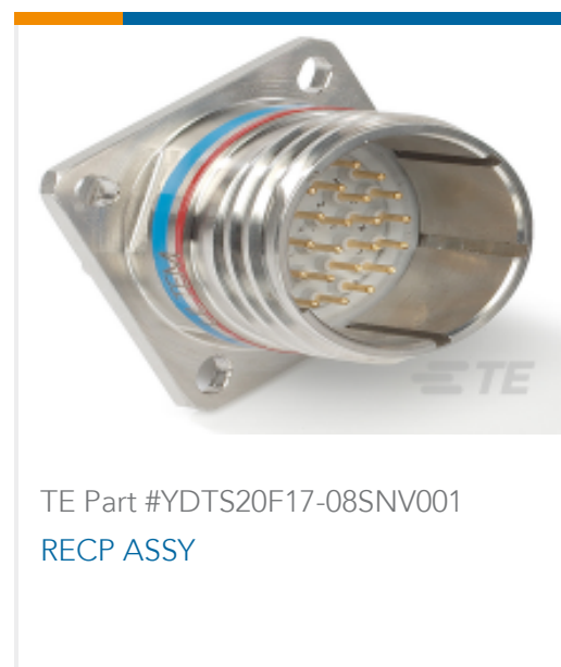
TE Part #YDTS20F17-08SNV001 RECP ASSY