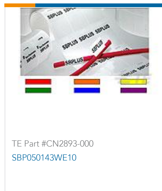
TE Part #CN2893-000 SBP050143WE10