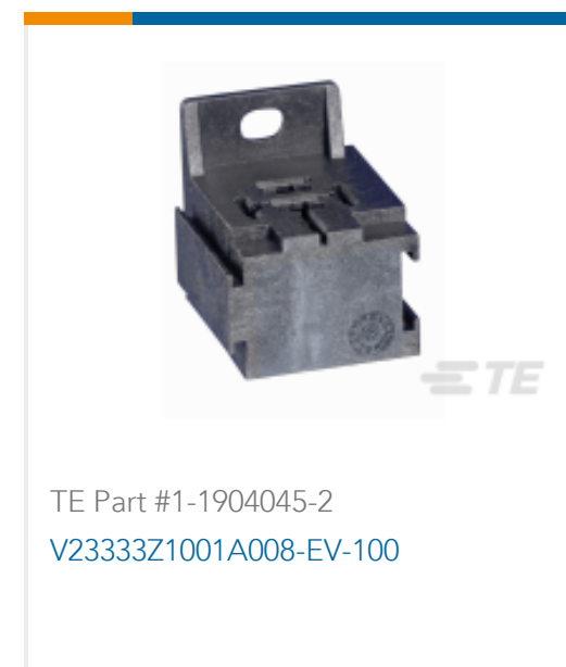
TE Part #1-1904045-2 V23333Z1001A008-EV-100