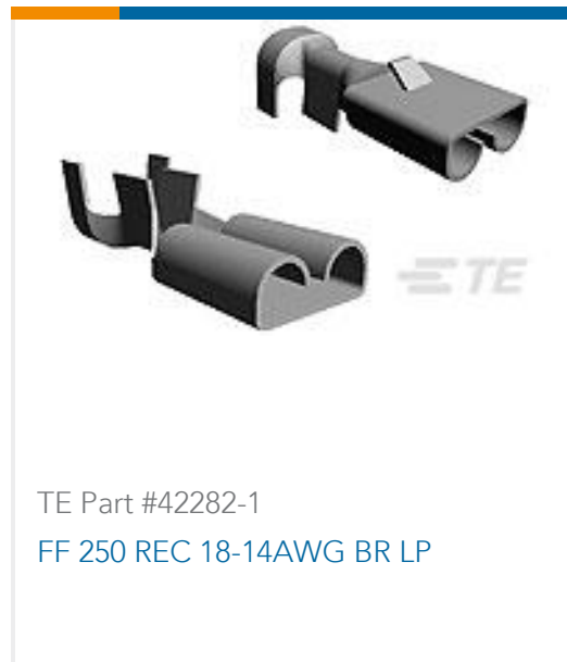
TE Part #42282-1 FF 250 REC 18-14AWG BR LP