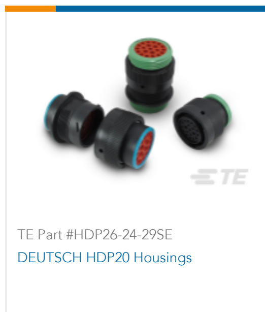
TE Part #HDP26-24-29SE DEUTSCH HDP20 Housings