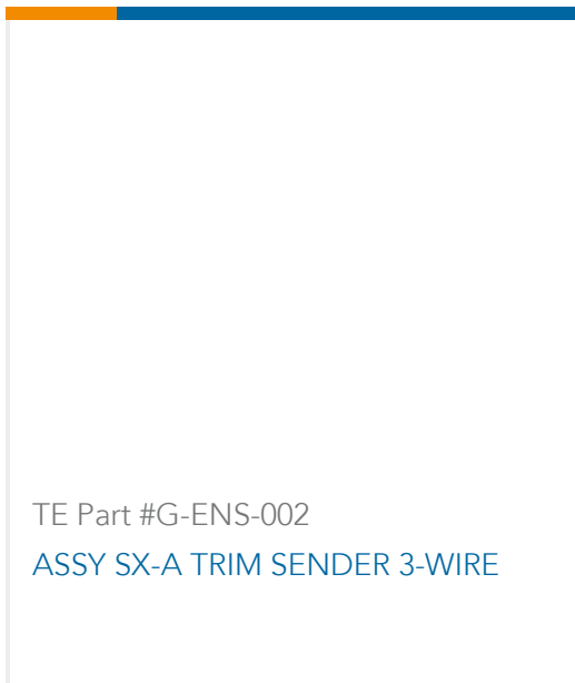
TE Part #G-ENS-002 ASSY SX-A TRIM SENDER 3-WIRE