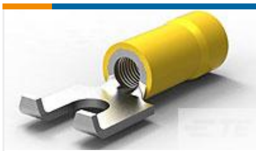
TE Part #52856-1 TERMINAL,PG SPD FLG 12-10 10