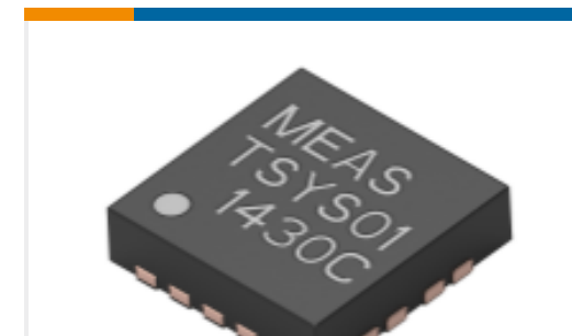
TE Part #G-NICO-023 0.1 DEG C ACCURACY QFN TEMP SENSOR