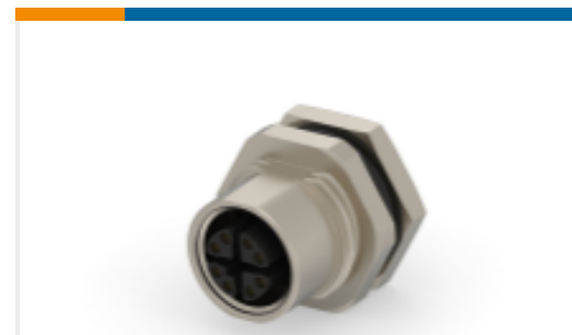
TE Part #2232331-1 RPC-M12X-FF-8CON-M16-LBU