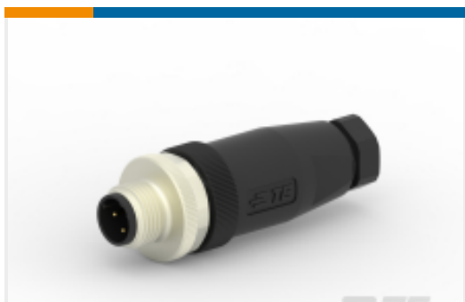
TE Part #T4111501041-000 M12,MALE,STRAIGHT,D CODE,4P, PG7,GOLD