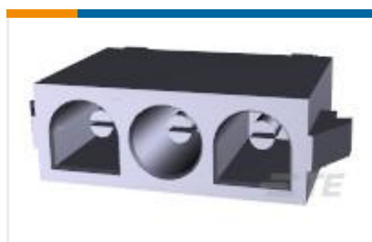
TE Part #350583-4 03P UMNL PIN HDR ASSY V2 LF