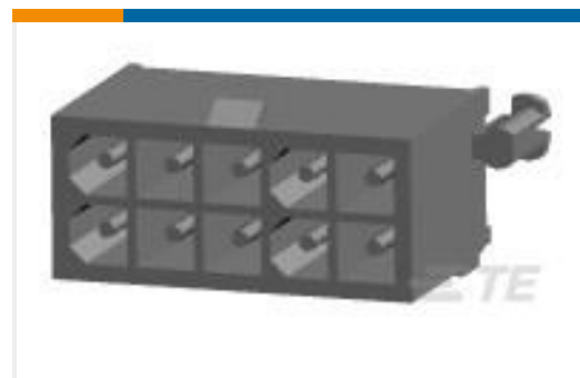
TE Part #1-770743-1 10P MINI UMNL HDR ASSY VRT LF