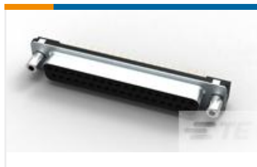
TE Part #1-5747301-4 37 RCPT SP/FMS SCRLK