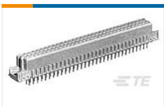
TE Part #535032-4 096 EURO TYPE C RECEPT AP ASSY