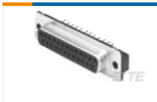
TE Part #1-5745967-6 25 RCPT SP/FMS SCRLK