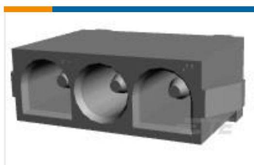
TE Part #350429-4 03P UMNL PIN HDR ASSY NATL LF