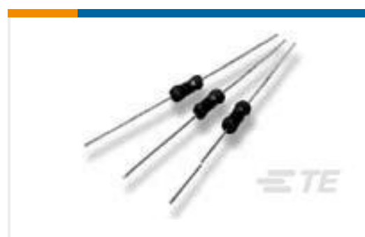
TE Part #1-1879355-8 RR03 5% 22K AMMO