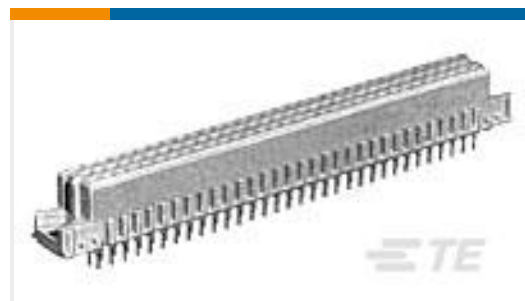
TE Part #535032-4 096 EURO TYPE C RECEPT AP ASSY