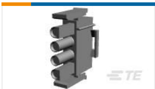
TE Part #1-480702-9 04P UMNL PLUG HSG BLK