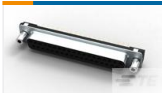
TE Part #1-5747301-4 37 RCPT SP/FMS SCRLK