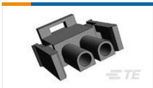
TE Part #1-480698-1 02P UMNL PLUG HSG BRN