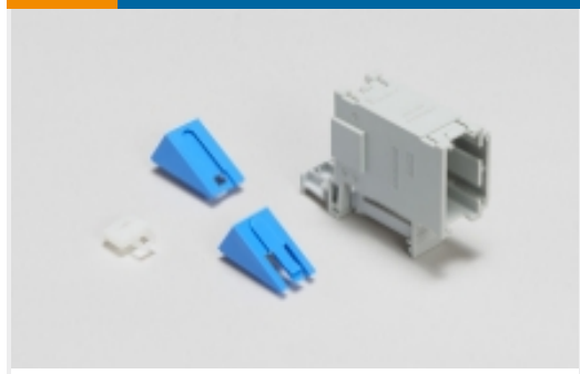
Rectangular Connector Adapters(7)