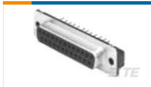
TE Part #1-5747299-6 15 RCPT SP/FMS SCRLK