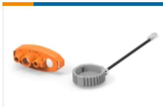
Connector Caps & Covers(34)