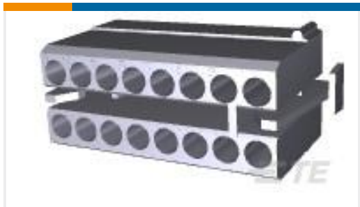
TE Part #1-480438-0 16P CMNL PLUG HSG M/M NATL