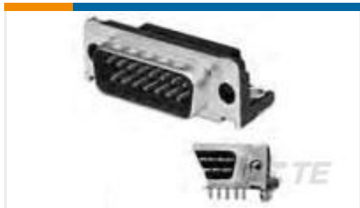
TE Part #5747236-4 15 MSFL PLUG RA 318 (IN,FM)