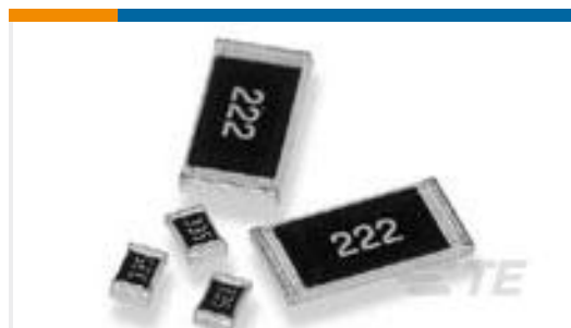
TE Part #1622872-1 CRG0603 1% 1K5