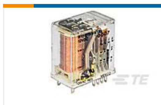
TE Part #1-1393767-5 R10-E2X2-V700=R10