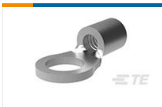
TE Part #2-34123-1 TERMINAL,SOLIS R 16-14 10