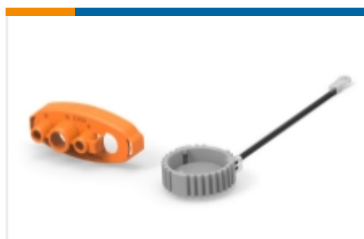
Connector Caps & Covers(34)