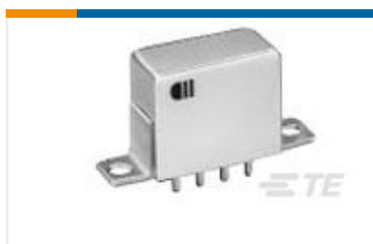
TE Part #1-1617004-0 B07D034BC2-0053 = M5757/23-005