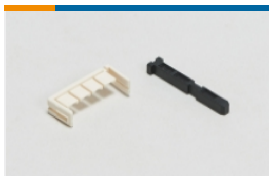
Rectangular Connector Keying Plugs(3)