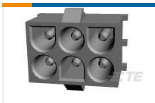
TE Part #350711-4 06P UMNL PIN HDR ASSY 94VO LF