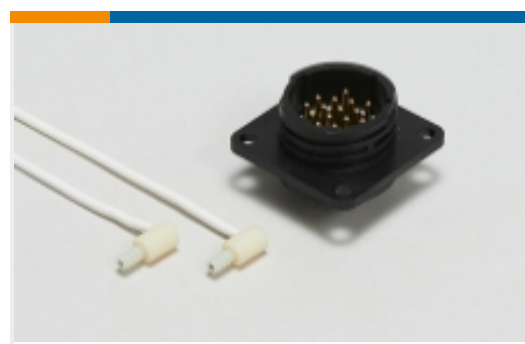
Circular Power Connectors(2)