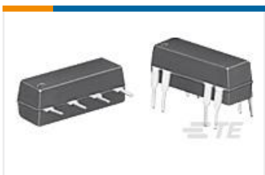
TE Part #1-1393771-6 JWD-171-24=REED RELAYS