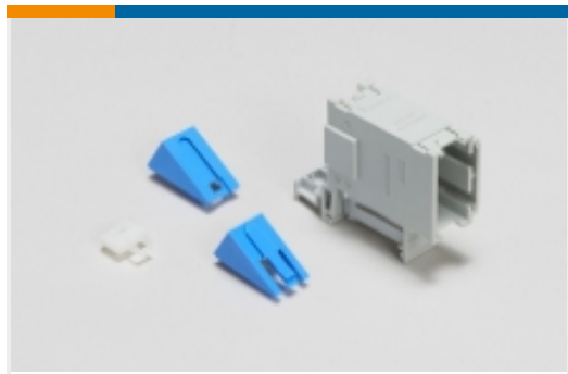
Rectangular Connector Adapters(7)