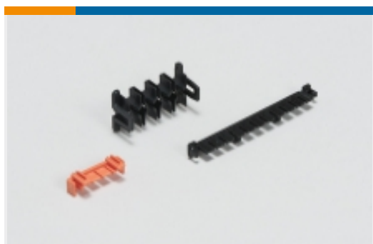
Rectangular Connector Locking(8)