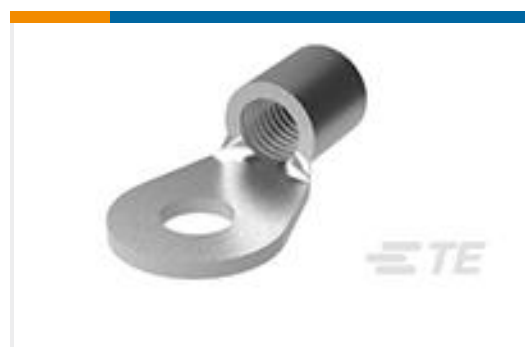
TE Part #35184 TERMINAL,SOLIS R 2 3/8