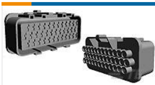
TE Part #344111-1 36W EMS.REC. HSG.ASSY