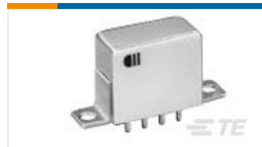
TE Part #4-1617004-0 B07D932BC2-0348 = M5757/23-031