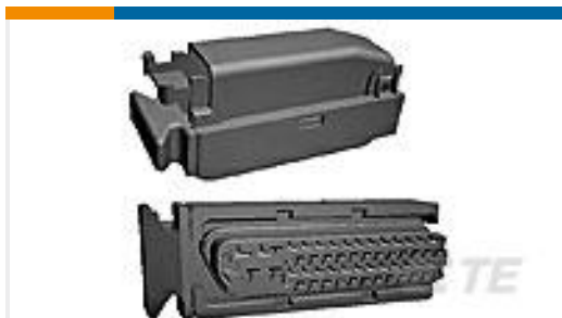
TE Part #1393450-3 V23542C1052B102=52P KABELBAUM-