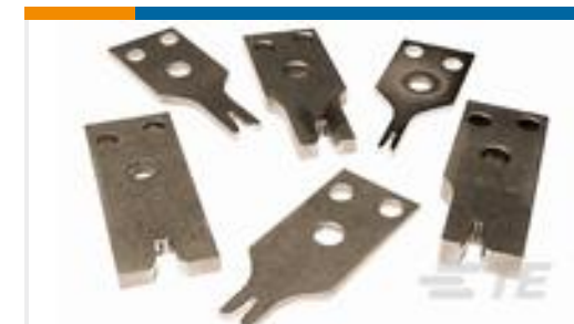
TE Part #852743-3 CRIMPER, WIRE