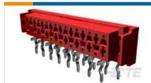
TE Part #1-338070-0 MICRO-MATCH FEM.SE