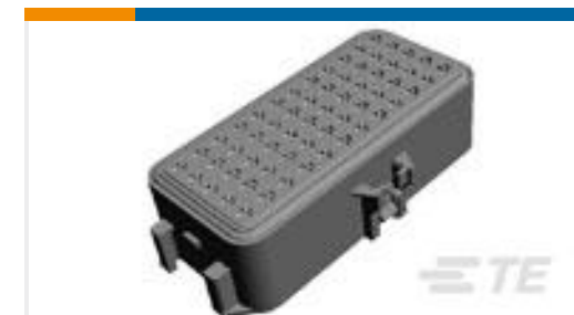
TE Part #1443997-2 BASE ASSEMBLY, 60 POSITION, BB