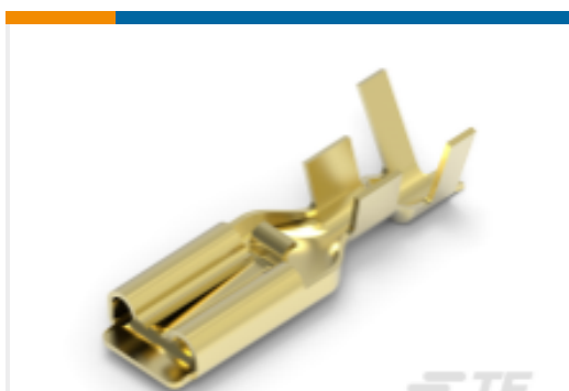
TE Part #2331225-1 187 PL EX REC. 20-14AWG PTBR