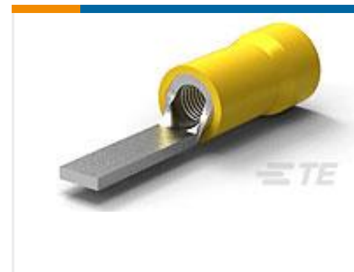
TE Part #131445 PG, WIRE TAB, 12-10