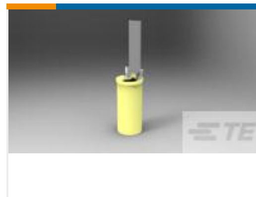
TE Part #324543 TAB, PIDG 12-10