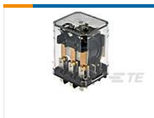
TE Part #2-1393117-1 KUP-11A15-24=KU