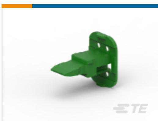
TE Part #W4SC-P012 WEDGE LOCK, 4P, PLG, GRN, SL RET, DT, C