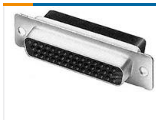
TE Part #5788816-1 RCPT ASSY, 26P, HDP-22, CN