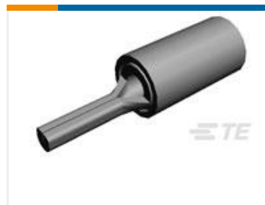
TE Part #165172 PIDG WIRE PIN