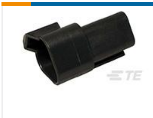
TE Part #DT04-3P-E004 REC, 3P, BLK, N