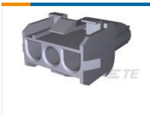
TE Part #1-480701-9 03P UMNL CAP HSG BLK