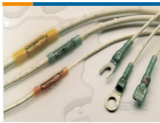
TE Part #BM3033-000 CPGI-406-1-2-3-24