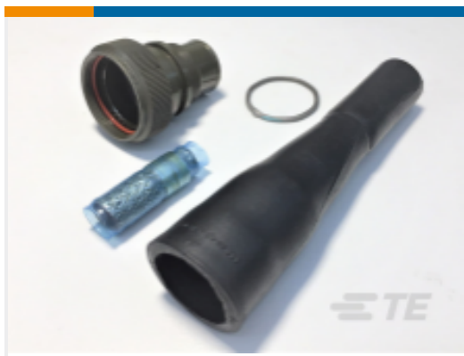
TE Part #943465-000 3014-10-130408