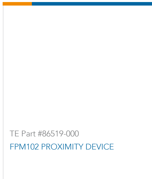
TE Part #86519-000 FPM102 PROXIMITY DEVICE