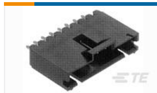
TE Part #6-103639-9 20 MTE HDR SRST LATCH .100CL