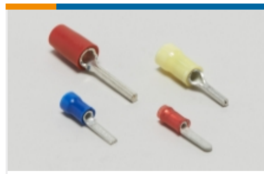
Crimp Wire Pins, Tabs & Ferrules(25)