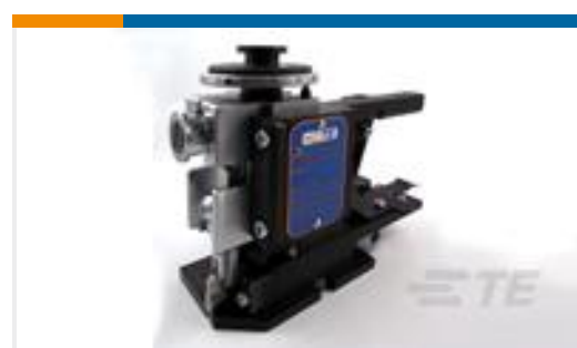
TE Part #2150150-1 OCEAN_2.0_Applicator-E-062O062O