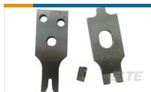
TE Part #7-2150150-7 OCEAN_2.0_SPARE_PART_KIT-062O062O