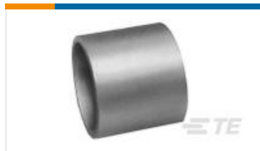
TE Part #324442 SPLICE,AMPOWER PARA 2