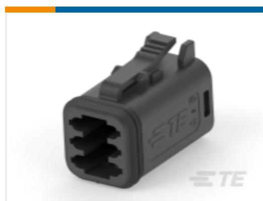
TE Part #2600035-1 6CCT BLACK PLUG W/SMALL SEAL