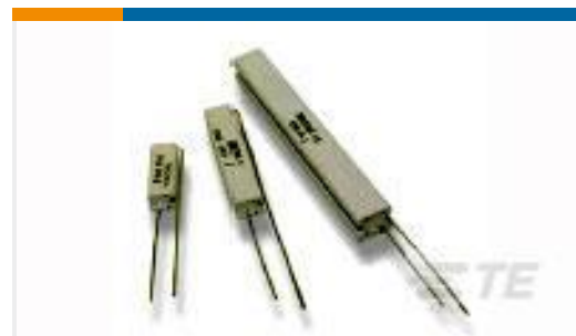
TE Part #3-1623732-0 BCHE 7 W 330R 5%