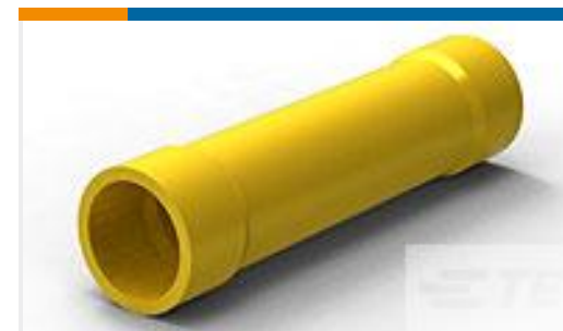
TE Part #8-34072-1 SPLICE,PG BUTT 12-10