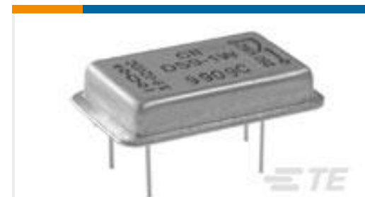
TE Part #1-1617069-0 DS9-1W=DS9 DIP SOLID STATE RELAY