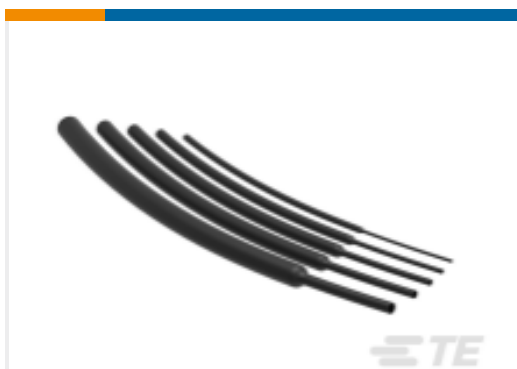
TE Part #NB14254001 VERSAFIT-1-0-FSP