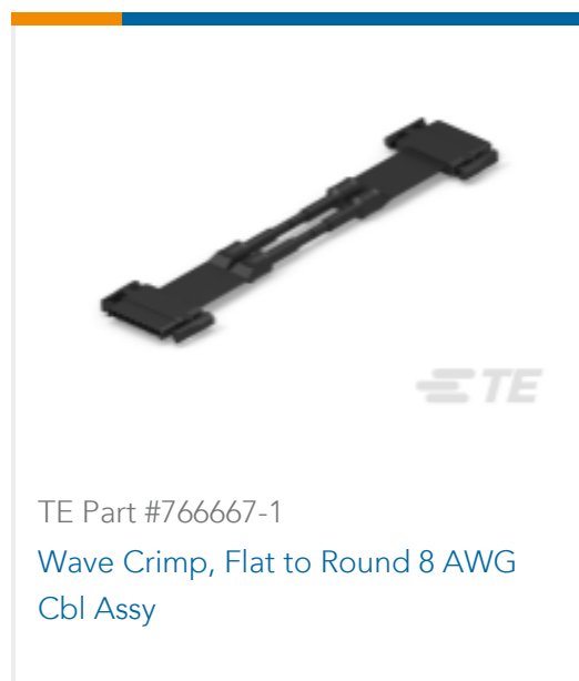
TE Part #766667-1 Wave Crimp, Flat to Round 8 AWG Cbl Assy