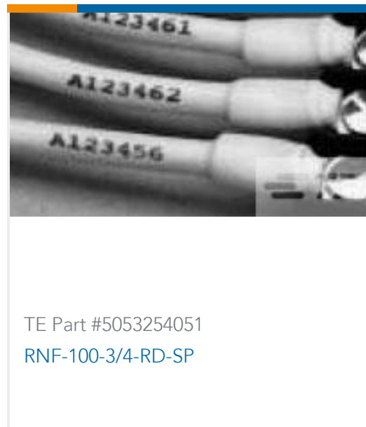
TE Part #5053254051 RNF-100-3/4-RD-SP