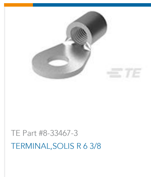
TE Part #8-33467-3 TERMINAL,SOLIS R 6 3/8