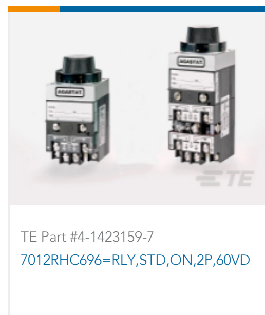
TE Part #4-1423159-7 7012RHC696=RLY,STD,ON,2P,60VD