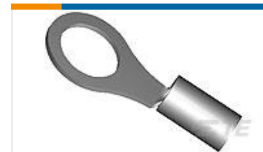
TE Part #35684 TERMINAL,SOLIS R 14-12 6