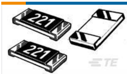
TE Part #6-1622820-4 3520 82R 5%