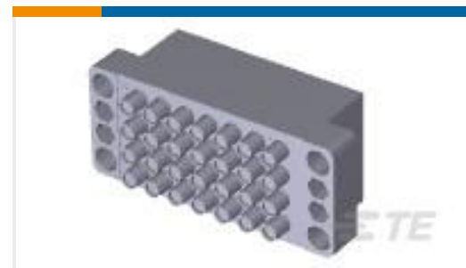
TE Part #205690-2 SOC. BLOCK 28 POS. SPL.