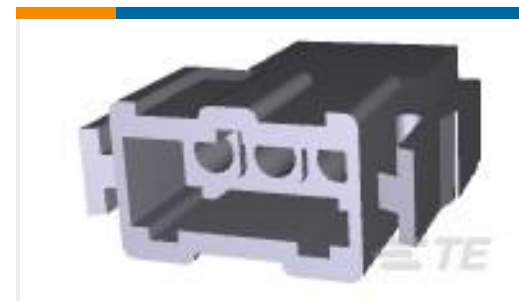
TE Part #207359-1 RECEPT HSG,3 POSN,METRIC