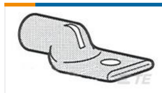
TE Part #325605 TERMINAL,AMPOWER 4/0 1/2