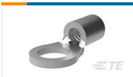
TE Part #2-32186-7 BUDGET RING 16-14 6