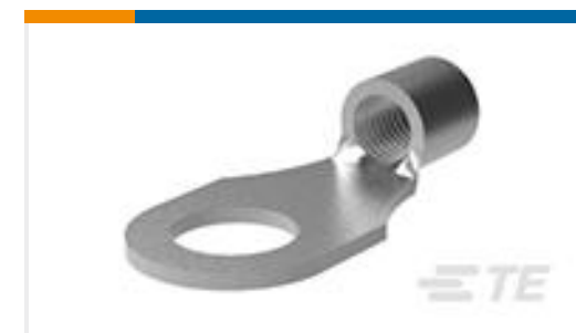
TE Part #34484 TERMINAL,SOLIS R 14-12 10