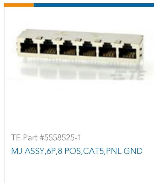
TE Part #5558525-1 MJ ASSY,6P,8 POS,CAT5,PINL GND