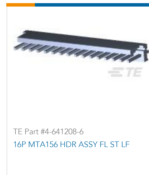
TE Part #4-641208-6 16P MTA156 HDR ASSY FL ST LF