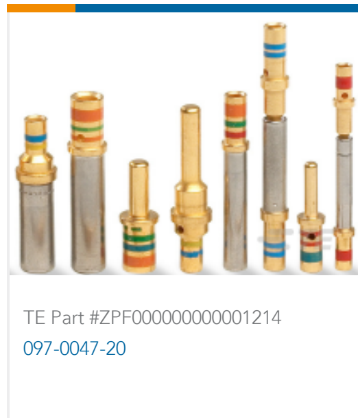
TE Part #ZPF0000000000001214 097-0047-20