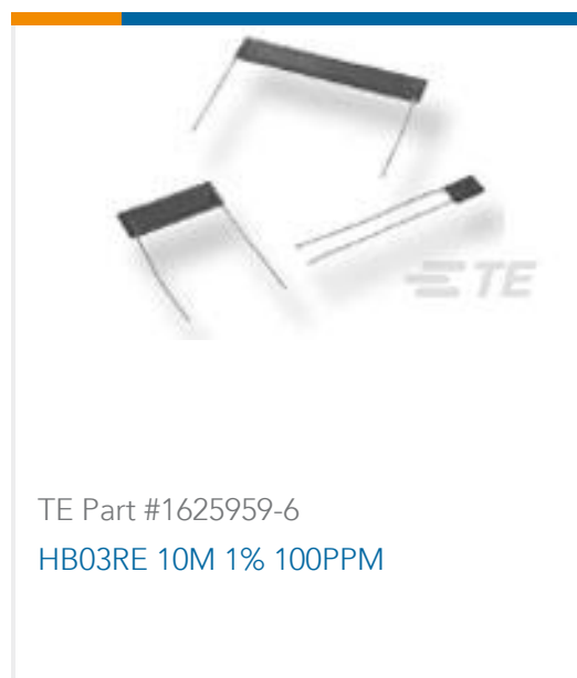
TE Part #1625959-6 HB03RE 10M 1% 100PPM