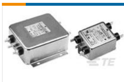
TE Part #6609042-3 10VS1=F7248 S0