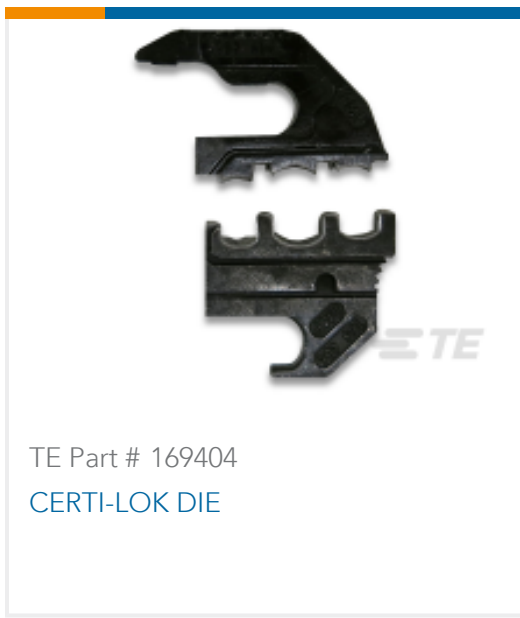
TE Part # 169404 CERTI-LOK DIE