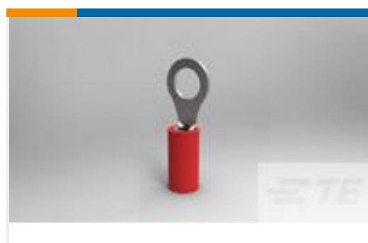
TE Part #32837 PIDG R 22-16 COMM 22-18 MIL 10