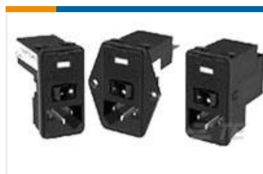
TE Part #7-6609107-3 PS0S0SS3A=C1186