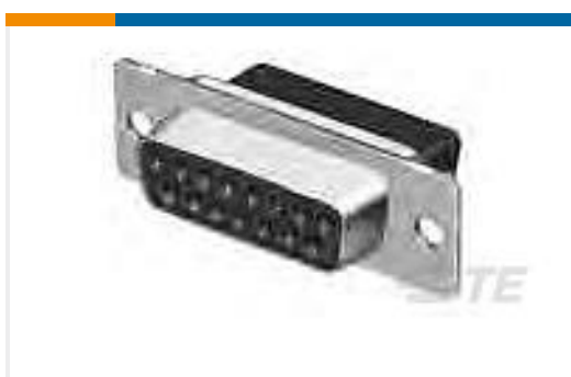
TE Part #205209-7 RECP ASSY SIZE 4