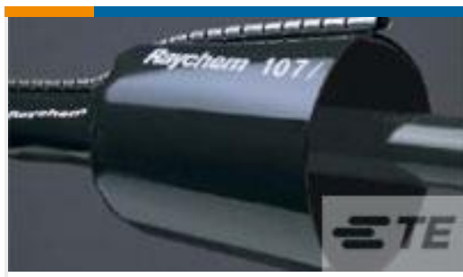
TE Part #298891-000 CRSM-84/20-750