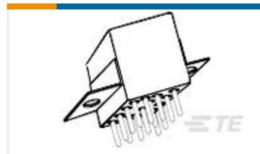
TE Part #2-1617754-1 FCA-410-1622M=M83536/16-022M