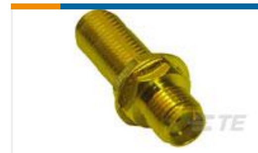
TE Part #1883077-1 2084 5108 02 SMA BULKHD FEEDTHRU