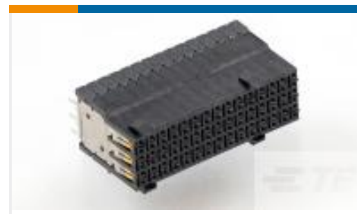
TE Part #5120786-1 ZP HS3 DB 06R REC 060P CT PD