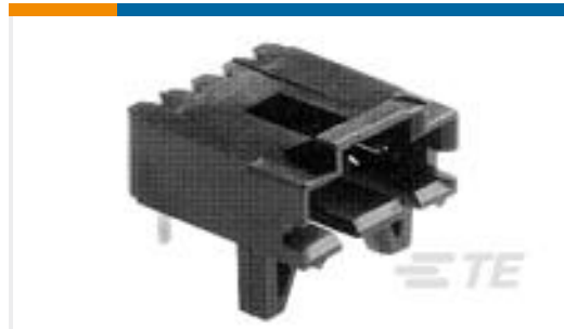
TE Part #5-103904-1 2 MTE HDR SRRA LATCH W/HLDWN