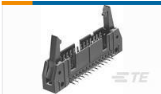
TE Part #5102322-1 A/L UNIV HDR 10P RA LG LAT