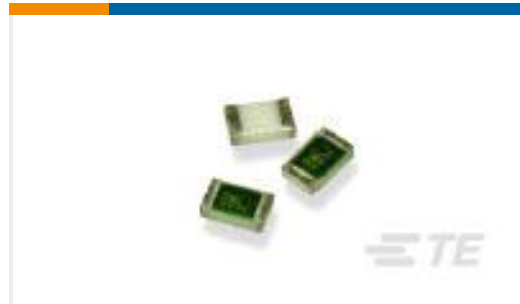
TE Part #8-1676481-5 CPF 0603 27K 0.1% 25PPM 1K RL