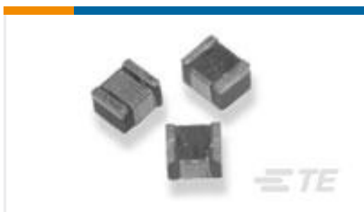
TE Part #8-1624112-6 3650 0603 82nH 5% 2K RL