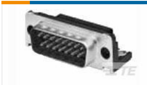
TE Part #5788794-1 25 HTMSFL PLUG RA 318 (IN,BL)