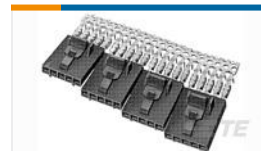
TE Part #103956-3 5X4 MTE RCPT SR LATCH .100CL