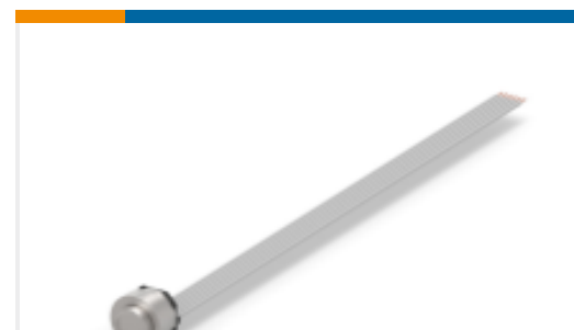
TE Part #87N-1000A-0R 1000PSIA MV PRESSURE SENSOR W /CABLE