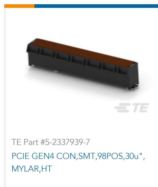
TE Part #5-2337939-7 PCIE GEN4 CON,SMT,98POS,30u", MYLAR,HT