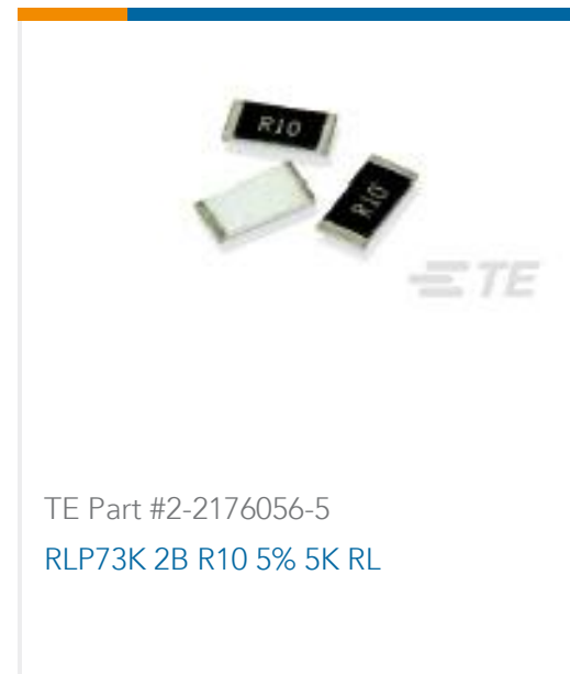
TE Part #2-2176056-5 RLP73K 2B R10 5% 5K RL