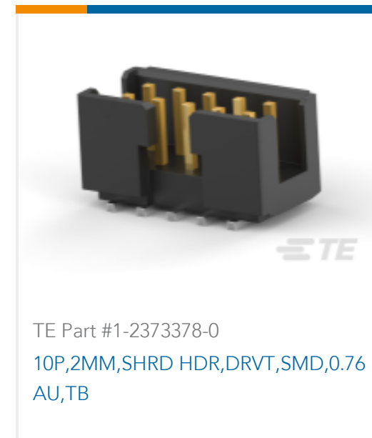
TE Part #1-2373378-0 10P,2MM,SHRD HDR,DRVT,SMD,0.76 AU,TB