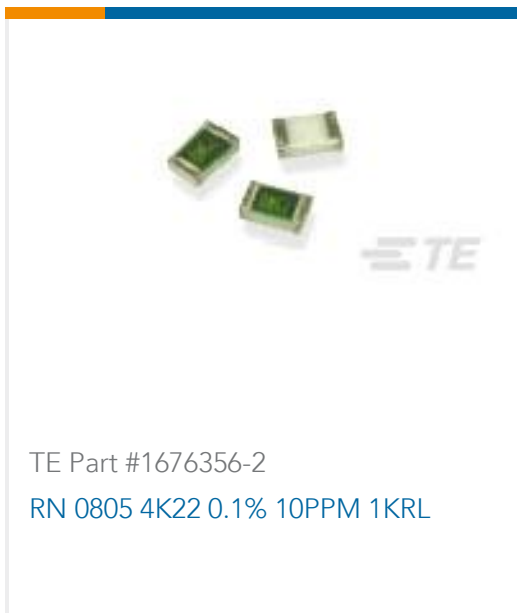
TE Part #1676356-2 RN 0805 4K22 0.1% 10PPM 1KRL