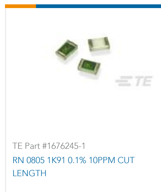
TE Part #1676245-1 RN 0805 1K91 0.1% 10PPM CUT LENGTH