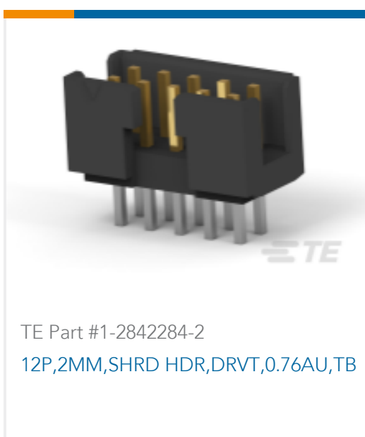
TE Part #1-2842284-2 12P,2MM,SHRD HDR,DRVT,0.76AU,TB