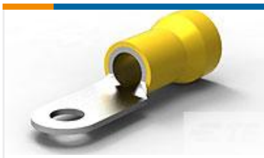
TE Part #52043-1 TERMINAL R PG 4 1/4