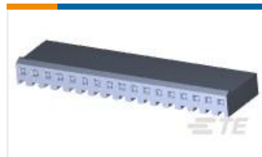
TE Part #1-640250-7 17P SL156 HSG W/LCK RAMP NATL