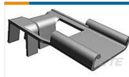
TE Part #60419-2 250 FASTON FLAG REC 18-14 AWG TPBR