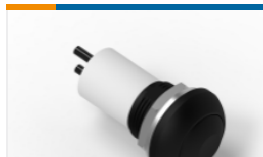
TE Part #2329384-1 PB OFF/ON FC BLK M1 TERM IP68 500MM L