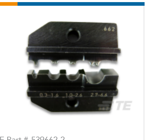
TE Part # 539662-2 MATR SOLISTR 0,3-6,