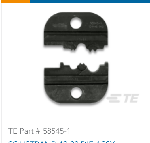
SOLISTRAND 10-22 DIE ASSY