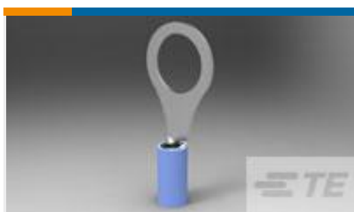
TE Part #328998 TERMINAL,PIDG R 16-14 5/16