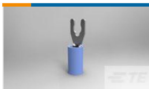
TE Part #52935 TERMINAL,PIDG SPR SPD 16-14 6