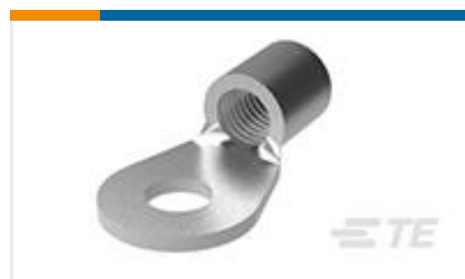
TE Part #36917 TERMINAL,SOLIS R 1/0 3/8