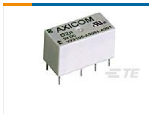
TE Part #2-1393793-1 V23105A5505A201