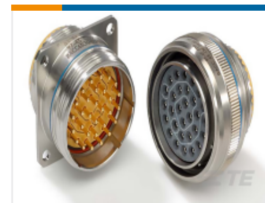
TE Part #ZPF000000000164349 983-ORS 10-05 PY