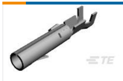
TE Part #60617-4 CMNL SOK PTPPHBZ L/P