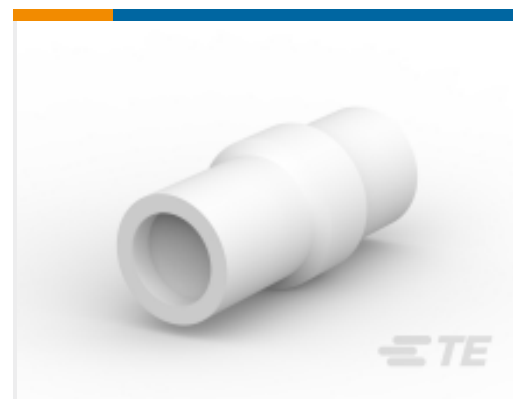
TE Part #170887-4 SLEEVE DIA5 SHUR PLUG NAT