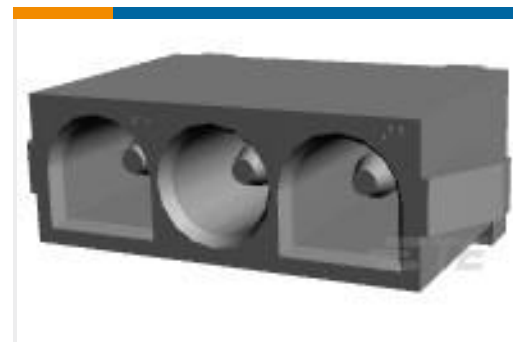
TE Part #350429-1 03P UMNL PIN HDR ASSY NATL