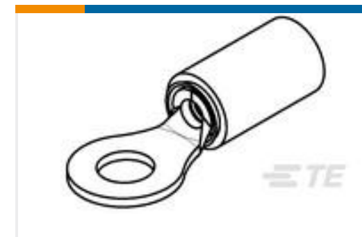
TE Part #1577639-1 TERMINAL RT PIDG PEEK STRATO 14-12 AWG