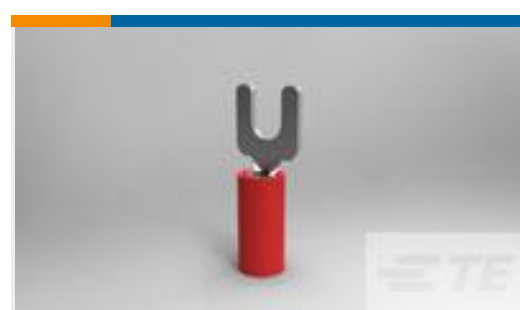
TE Part #8-34541-1 PIDG SPD 22-16COMM 22-18MIL 6