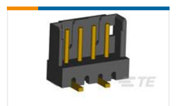
TE Part #292172-8 CT POST HDR ASSY 8P IN-TUBE BL