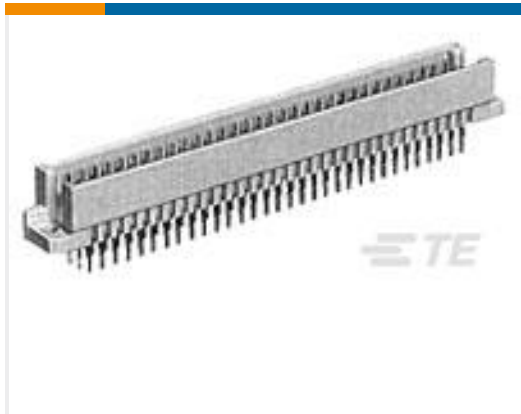
TE Part #5650918-5 ASSY,PIN,EUROCARD,TYPE R/2,LEA