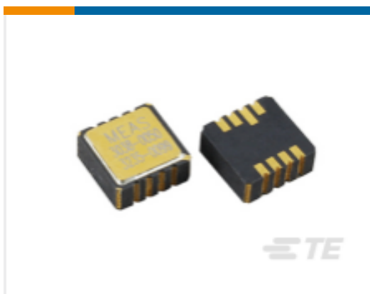
TE Part #3038-6000 Model 3038 SMT DC Accelerometers