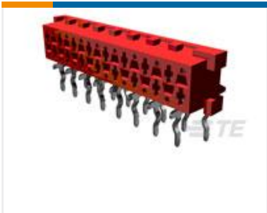
TE Part #9-215460-0 MICRO-MATCH FSID P