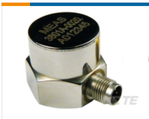
TE Part #3801A-0200 3801A ACCEL,200G RANGE