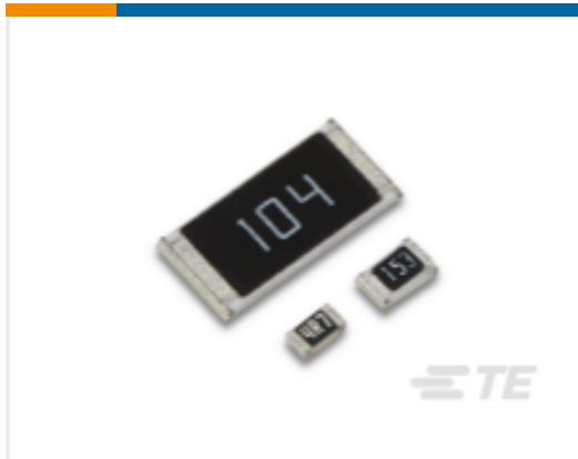
TE Part #2-2176343-3 CRGCQ 1206 680R 1%