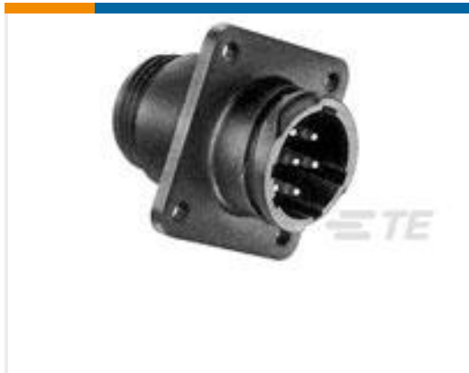
TE Part #211771-1 23-19 CPC RECEPT, STND SEX