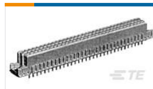
TE Part #535090-4 096 EURO TYPE C RECEPT ST ASSY