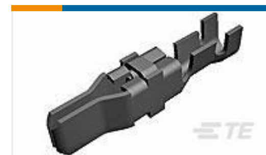
TE Part #66253-8 MALE CONTACT ASSY. (STRIP)