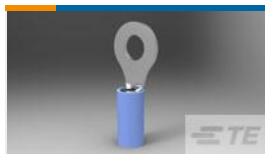
TE Part #321045 TERMINAL, PIDG R 16-14 1/4