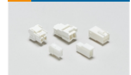
Rectangular Power Connectors(466)