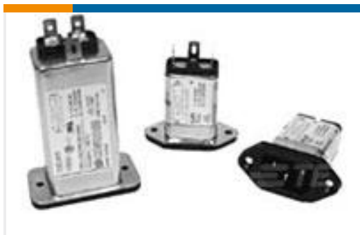
TE Part #6609008-3 6EJH1=F8043 S0