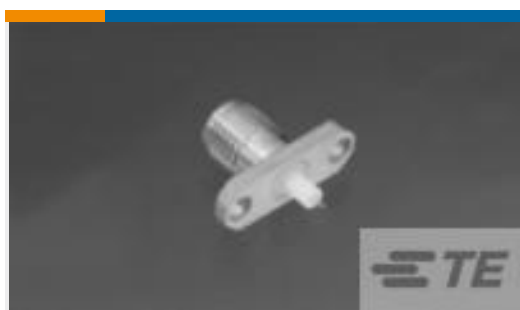
TE Part #1052902-1 2052 5674 02