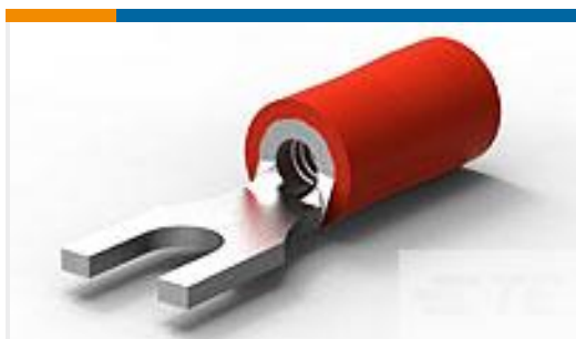
TE Part #165004 PLASTI-GRIP, SPADE 22-16 4